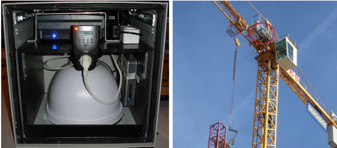
Figure 1: A detailed images of the 3G wireless image acquisition device adapted to be installed on a crane.

In order to fulfill the requirements for the high performance PTZ network camera included within the hardware device, Figure 1 show that the selected camera corresponds to a Toshiba IKWB-21A model. This IP camera includes a 1280x960 resolution CCD camera with a 22x optical zoom lens. Moreover, this camera operates as a stand-alone unit with a built-in web server where the AR application connects and obtains top-view images of the construction site in real time.